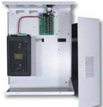
TP Medium-Kit, Power Module & PDM

PO Box 90 Kurrajong NSW 2758 Australia Tel +61 1300822769 sales@tacpower.com.au