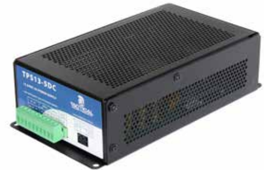
TPS13-5DC 13.5Vdc 5A Power Supply with Battery Charger