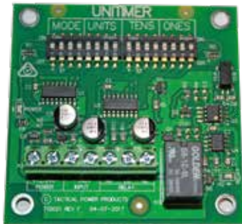
TIM-01 Universal Digital Timer