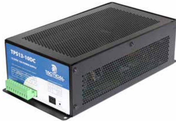
TPS13-10DC 13.5Vdc 10A Power Supply with Battery Charger