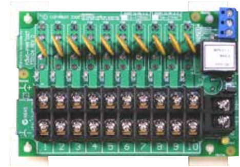
PDM6 Power Distribution Board

© 2016 The contents of this manual are copyright and may not be reproduced without the written permission of Tactical Power Products Pty Ltd.