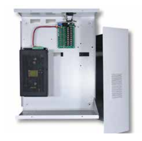
TP Medium-Kit, Power Module & PDM

PO Box 90 Kurrajong NSW 2758 Australia Tel +61 1300822769 sales@tacpower.com.au