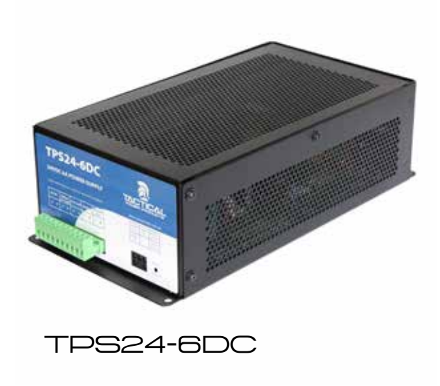
24Vdc 6A Power Supply with Battery Charger